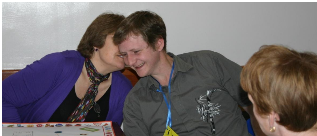
Figure 1 Information is passed in the ice breaker exercise ‘Chinese whispers’

However, there were many frustrations with telephone information services. Automated call routing was universally despised for the amount of time spent hanging-on and for the difficulty of using these services.