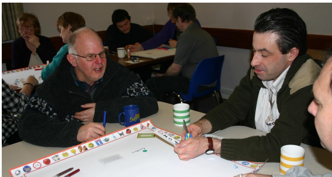
Figure 5 Multiple information channels are as important now as ever