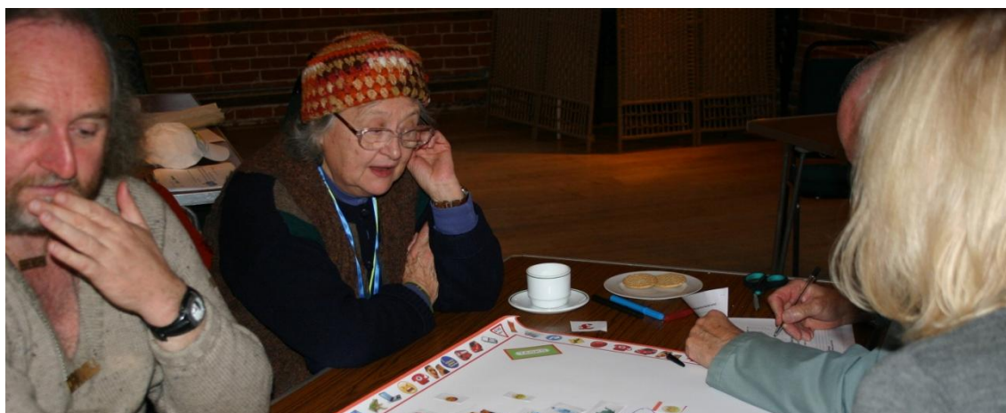
Figure 2 Family Carers need to become experts at the information game

“You always get voicemail, even in working hours . . . and press this, press that.”