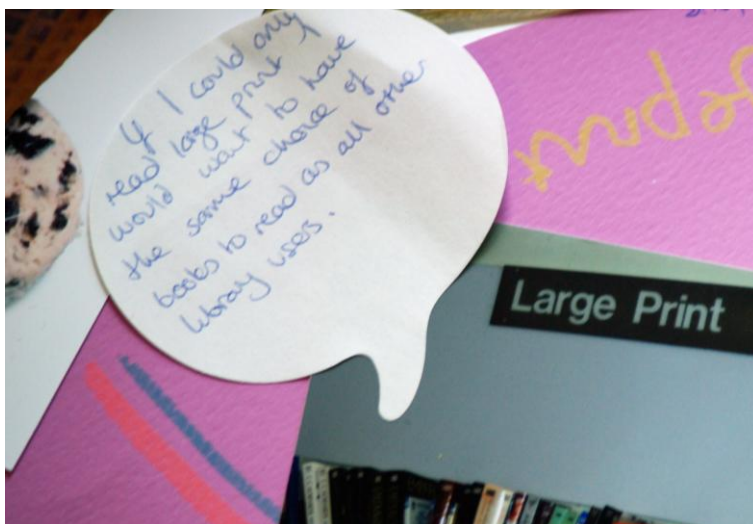
Figure 6 “If I could only read large print, I would want the same choice of books to read as other library users”

Older people made regular use of the library to access information about what’s on locally and about public transport but were often unaware of the availability of information on health and welfare issues.