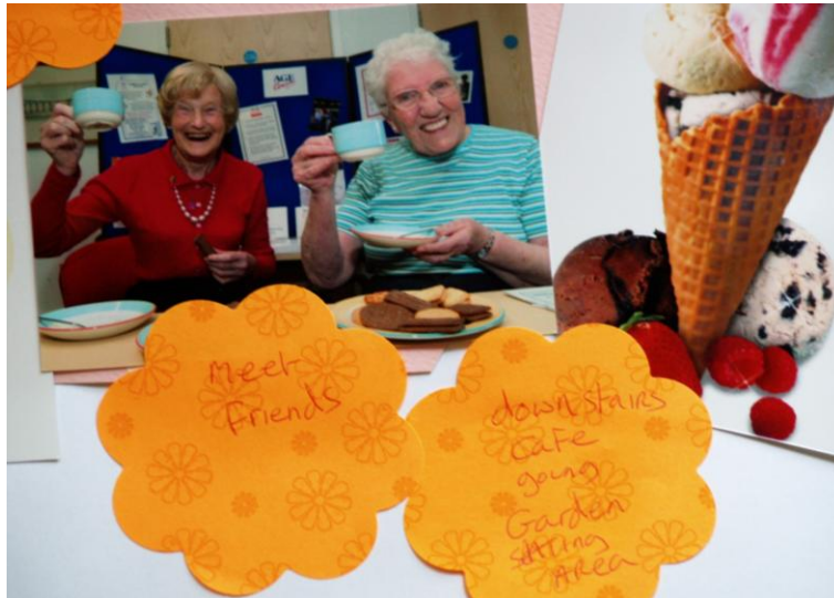
Figure 5 All groups saw libraries as a place where they could spend time with other people and possibly meet new people

The barriers, for people with mental health issues , to greater participation in library services were broadly similar to those of the wider population such as lack of time and lack of familiarity. For several, their mental health condition inhibited their participation however, one person who is fearful of going to places on her own did say that a library might be the kind of place she would consider visiting alone.