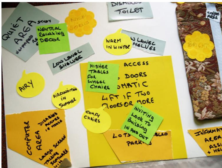
Figure 3 Model produced by people with physical disabilities. This group took an approach dominated by written labels but this serves to communicate many of the points they wanted to make

“We need computers with disabled access including a special large mouse, large screen, talking software with read-back, etc”