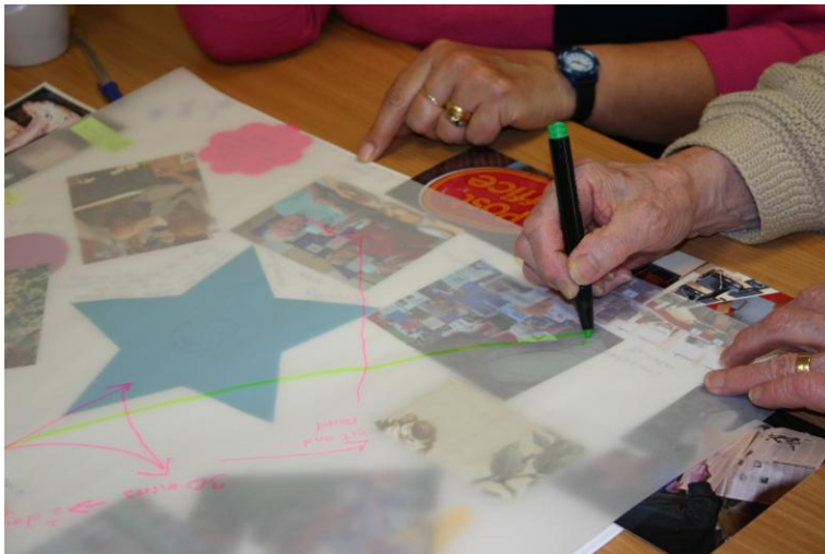
Figure 1 Illustrating Dream Library model

In view of the diverse range of abilities of the consultees and the topics to be explored, Cultural Intelligence recommended a creative approach and appointed an experienced Suffolk based Artist, Caroline Wright, to help develop and deliver a programme of creative consultation workshops.